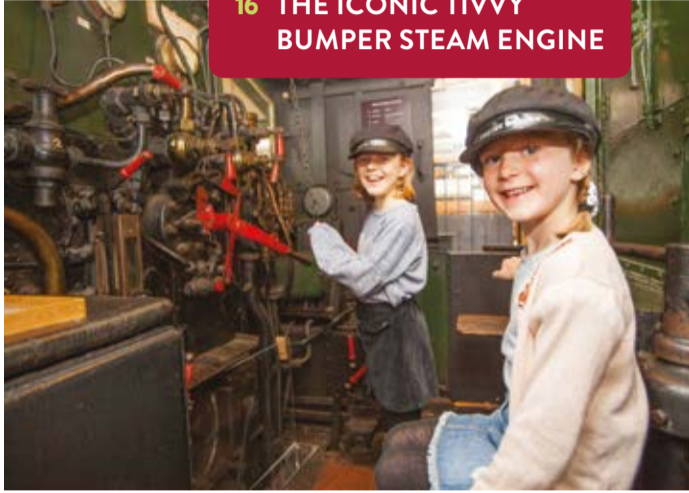
16 THE ICONIC TIVVY BUMPER STEAM ENGINE