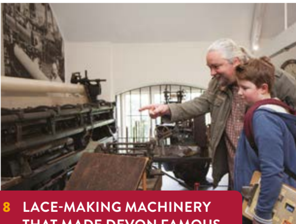
8 LACE-MAKING MACHINERY THAT MADE DEVON FAMOUS AROUND THE WORLD