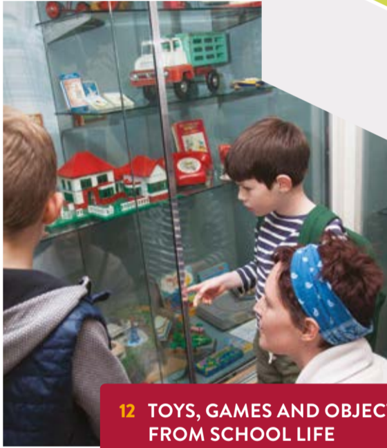
12 TOYS, GAMES AND OBJECTS FROM SCHOOL LIFE