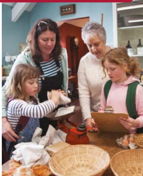
9 COOKING AND LAUNDRY EQUIPMENT FROM THE PAST 100 YEARS