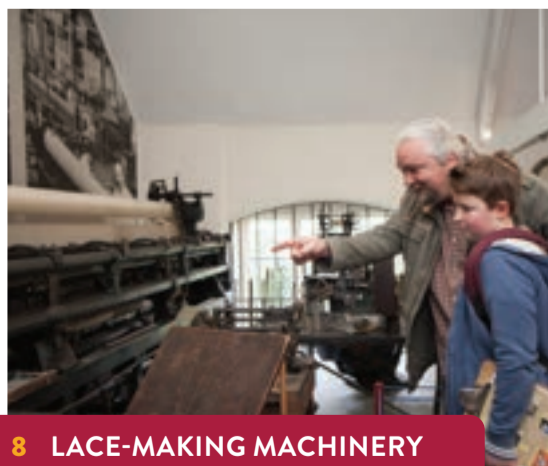
8 LACE-MAKING MACHINERY THAT MADE DEVON FAMOUS AROUND THE WORLD