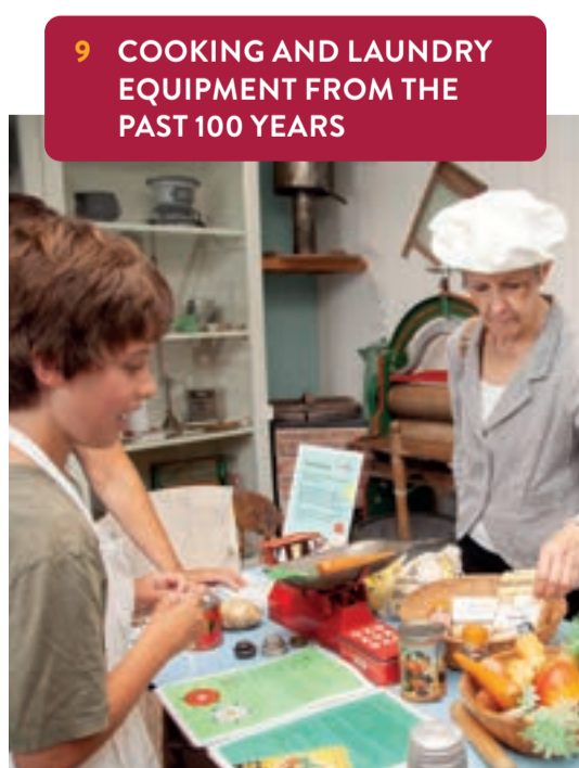
9 COOKING AND LAUNDRY EQUIPMENT FROM THE PAST 100 YEARS