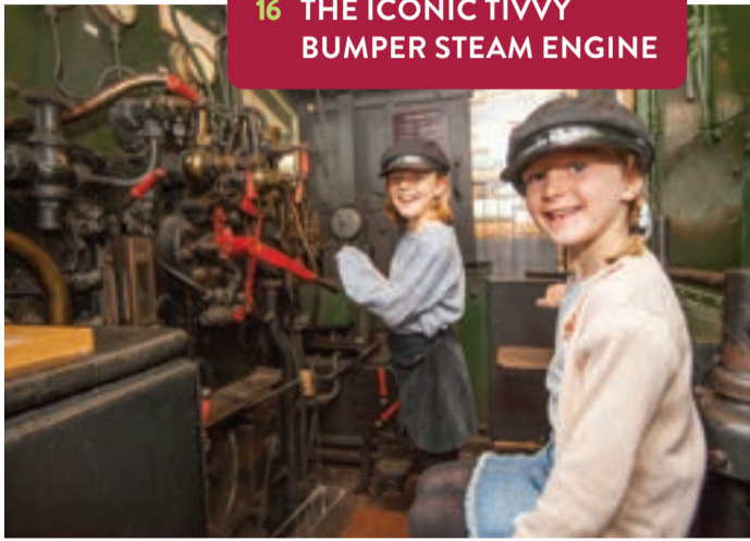
16 THE ICONIC TIVVY BUMPER STEAM ENGINE