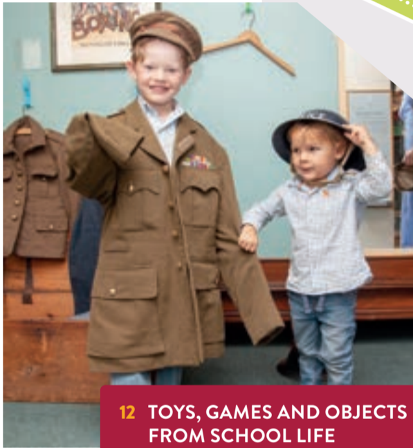
12 TOYS, GAMES AND OBJECTS FROM SCHOOL LIFE