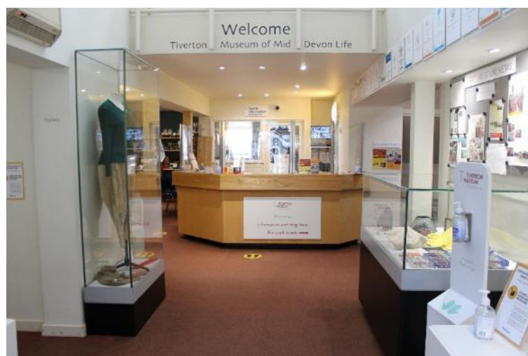
(Front door, foyer and front desk)

There is a one way route marked by arrows on the floor throughout the museum (and signage for wheelchair users to access the lift).